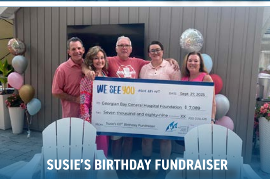
SUSIE'S BIRTHDAY FUNDRAISER