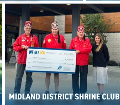
MIDLAND DISTRICT SHRINE CLUB