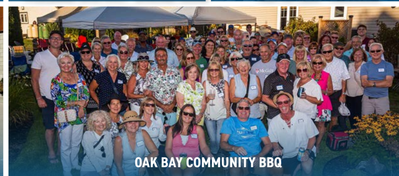
OAK BAY COMMUNITY BBQ