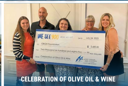
CELEBRATION OF OLIVE OIL & WINE