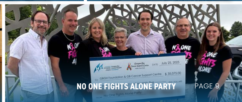
NO ONE FIGHTS ALONE PARTY