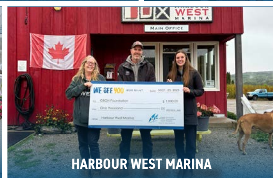
HARBOUR WEST MARINA