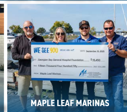
MAPLE LEAF MARINAS