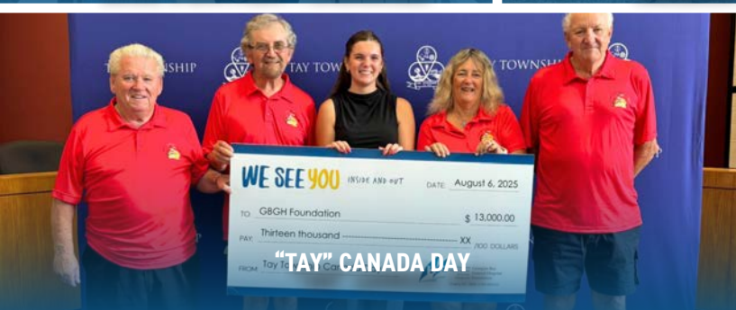
TAY CANADA DAY