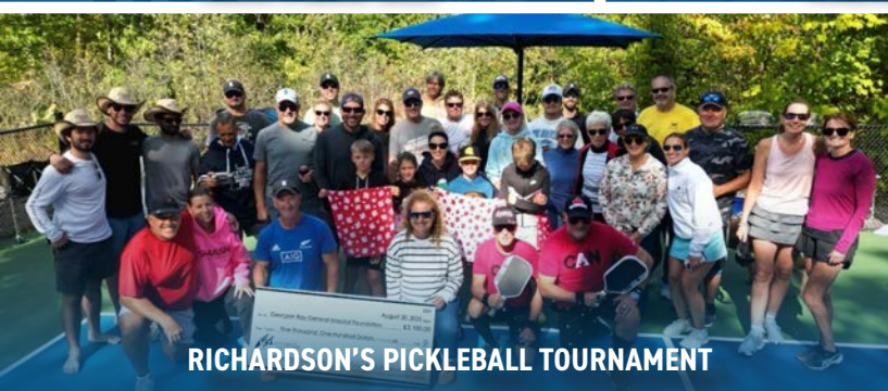
RICHARDSON'S PICKLEBALL TOURNAMENT