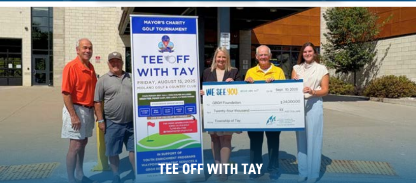
TEE OFF WITH TAY