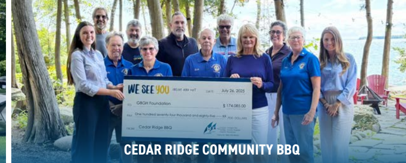
CEDAR RIDGE COMMUNITY BBQ