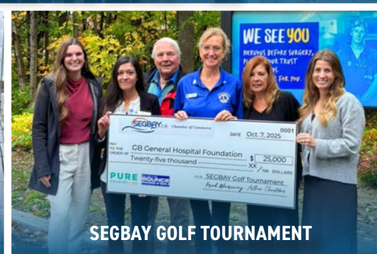
SEGBAY GOLF TOURNAMENT