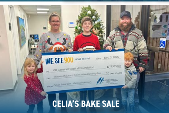
CELIA'S BAKE SALE